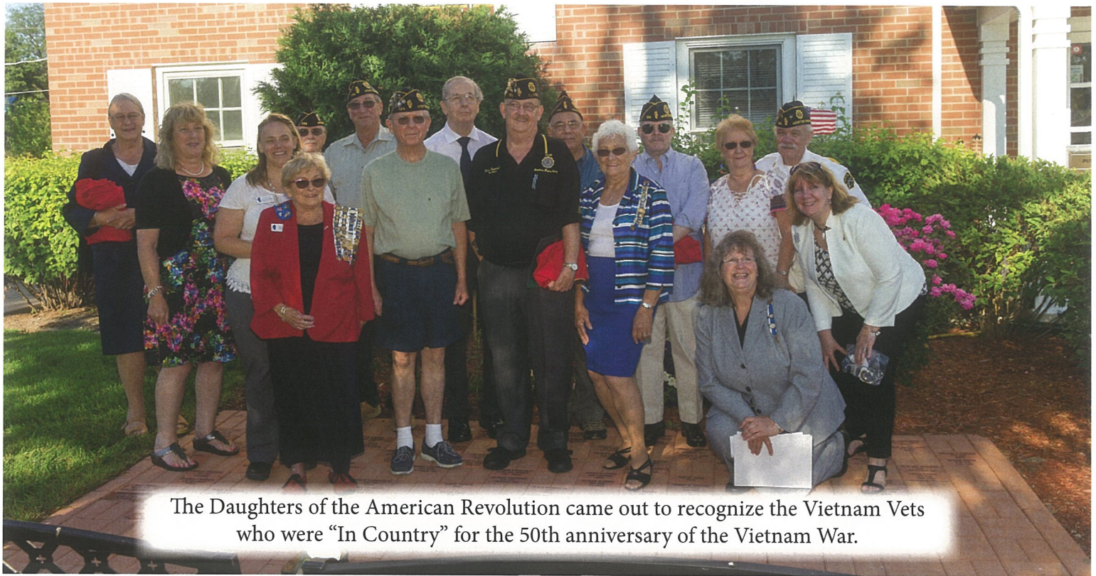
The Daughters of the American Revolution came out to recognize the Vietnam Vets who were "In Country" for the 50th anniversary of the Vietnam War.