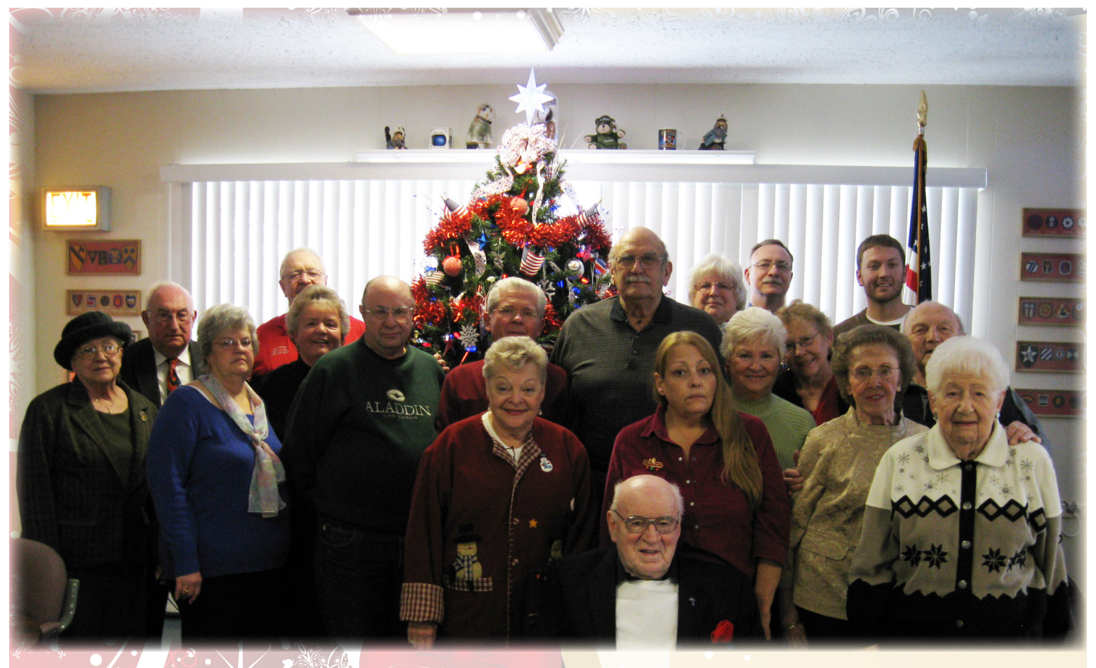
Post 134 had their Worker's / Christmas Party on Dec. 12, 2010